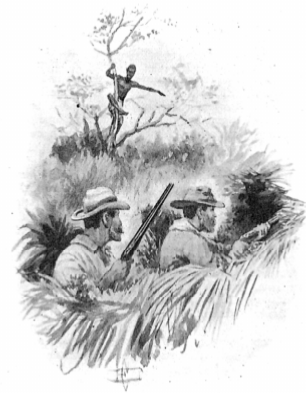
"THE ODDS WERE ALL IN FAVOR OF THE BUFFALO."

first ten minutes we proceeded along a pathway, through dense reeds about eight feet high, on the right bank of the stream, until another kraal was reached. Then we struck away at right angles. One of our guides was a short, thickset, light-