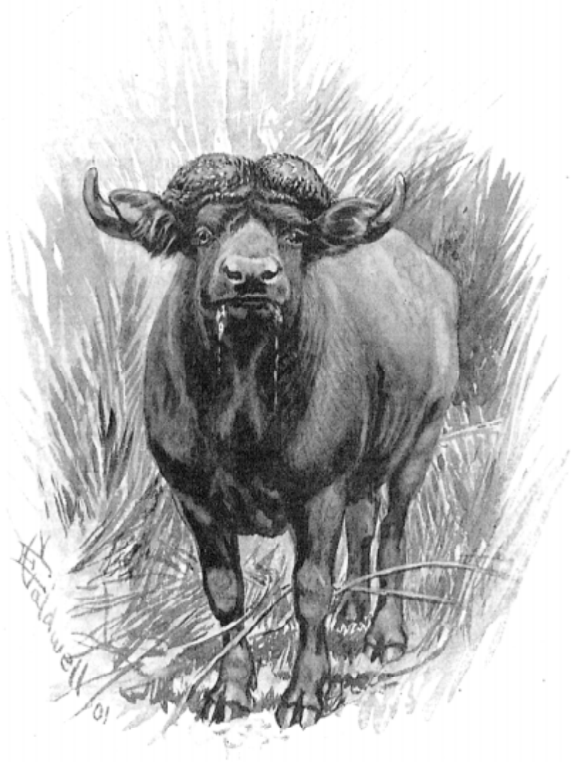
"HE BECOMES THE VERY EMBODIMENT OF MALIGNANT FEROCITY."

country imaginable. Just as we reached the other side of a dambo, two buffalo bulls rushed from a patch of reeds and passed close in front of us at a tremendous pace. B. and I each got in a hurried shot, and our bullets told on the larger of the two.