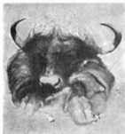
THE AFRICAN HUNTER'S MOST COVETED TROPHY.

I N the Pungwe River district of the Portuguese territory on the east coast of Africa fifty varieties of animals, ranging in size from elephants to jackals, roam over the country in troops of hundreds. It is one vast game