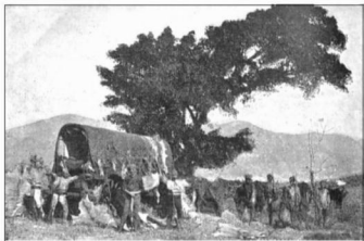
AN EAST AFRICAN CAMP.

as one of the hosts expressed it. From the limbs of trees situated on an eminence the party saw, through field-glasses, more than sixty different herds of game within a radius of ten miles. Attempts to count the number of animals in even one herd were futile, owing to their size and constant movement. A hunter of twenty-five years' African experience estimated that there were ten thousand head of game in sight. Among the herds were twenty-two elephant, several hundred buffalo and innumerable zebra, antelope, giraffe and eland.