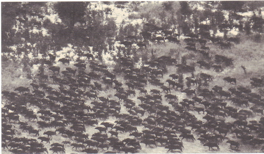
Buffalo massing before the rains in October-November 1966.