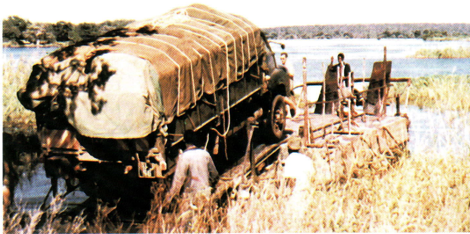
Loading the truck - weighing at least 10 tons - onto the ferry over the Zambezi at Kazengula to cross from northern Rhodesia to Bechuanaland. A time for prayer. 1968

By 1974, the five major safari companies