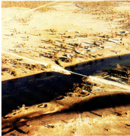
Aerial view of Maun. In the early '60s, Maun's population included only some 120 Europeans. Even the District Commissioner's office and the police post were mere grass-roof rondavels.

In 1960, there was one game ranger and six