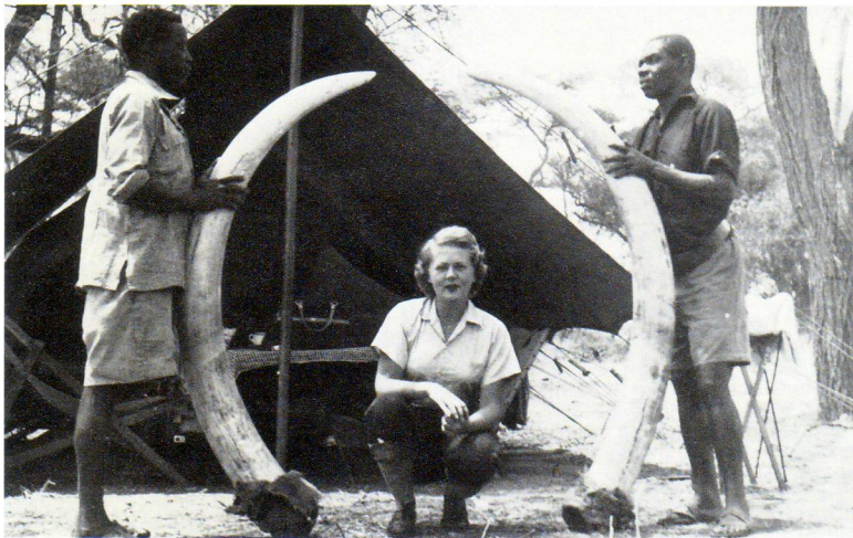
On safari shortly after marriage. Life in small towns in southern Tanzania was very hard for the game rangers' wives as their husbands were often gone for weeks at a time on extended foot safaris.