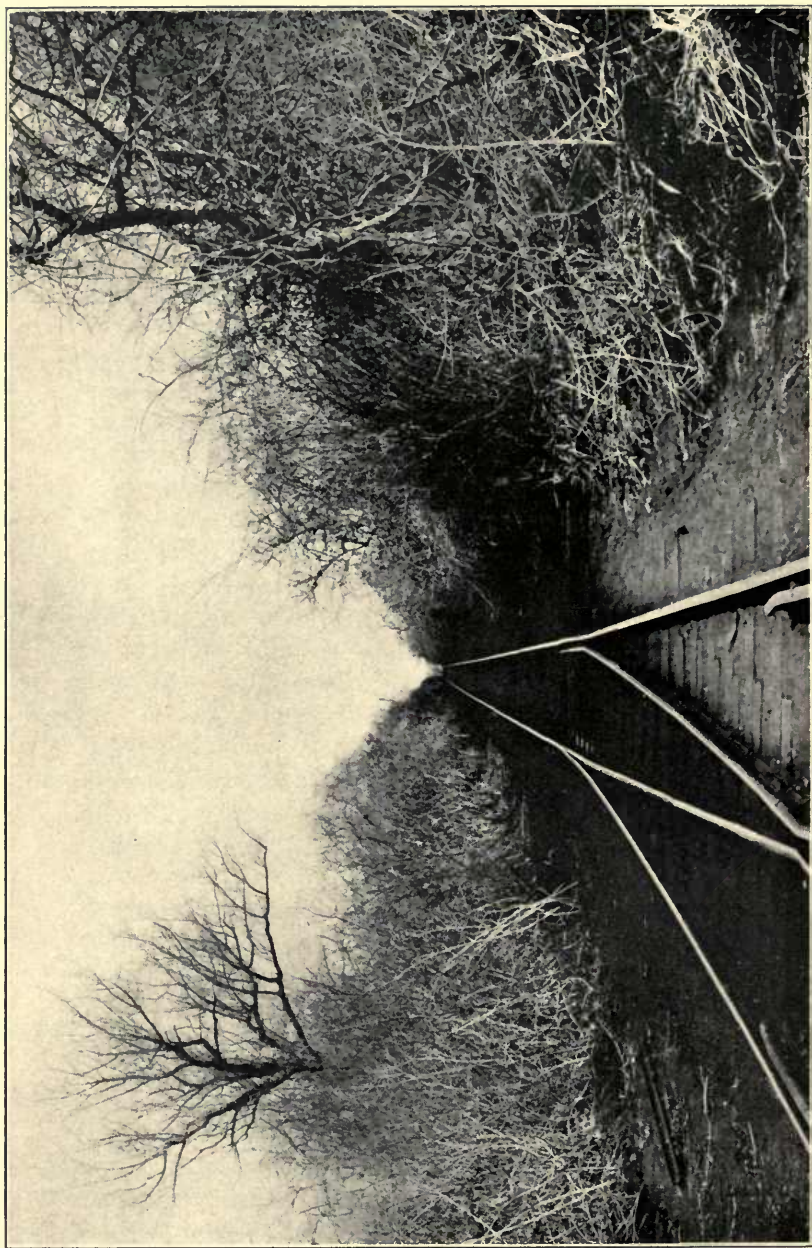
RAILWAY AND THORNY WILDERNESS NEAR TSAVO. (See p. 4.)