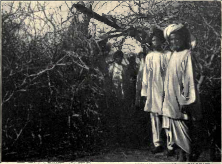
COOLIES AT ENTRANCE OF THEIR BOMA. (See p. 12.)