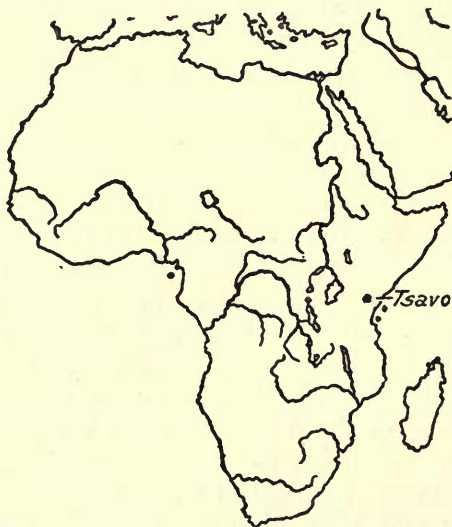
Map of Africa showing location of Tsavo.