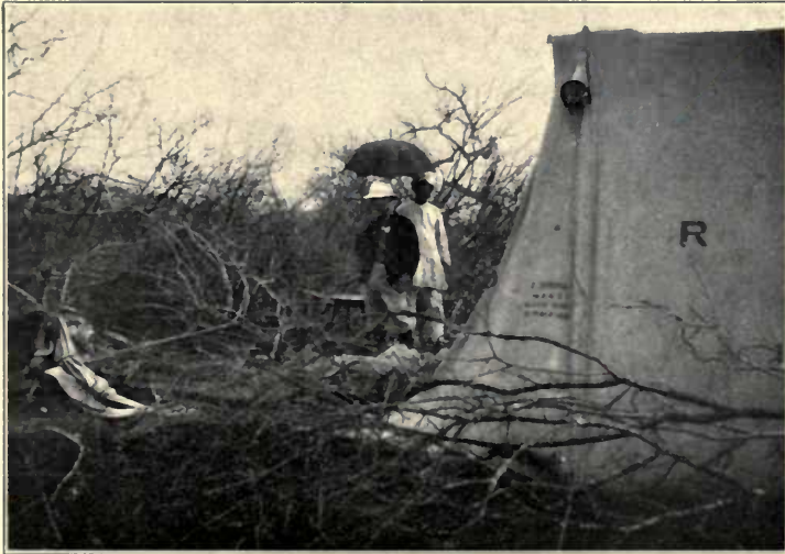
TENT FROM WHICH MAN WAS TAKEN. (See p. 22.)