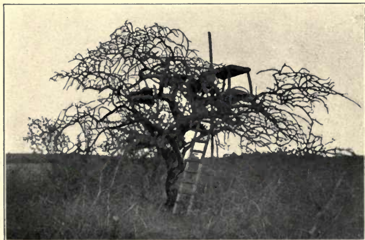
TREE FROM WHICH SECOND LION WAS SHOT. (See p. 37.)