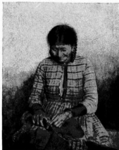
THE NORTH-LAND SHOEMAKER.

To be a good dog-driver and to run forty miles a day is to be a great man in this land of vast distances. There are instances where men have gone farther, but in most cases the going has been exceptional, or the "day" stretched