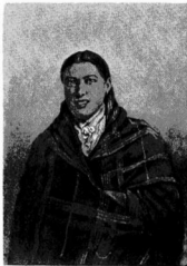
THE BELLE OF THE NORTH COUNTRY.

Priests have not yet taught the Indians the golden rule, nor implanted respect for virginity. Chastity is regarded as a virtue to be honored in the breach rather than in the observance, and fidelity seems by no