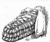
PAPPOOSE IN ITS MOSS BAG.