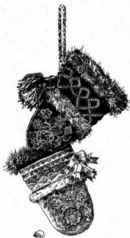
HAND-WARMERS OF THE NORTH.

The farther north, the better the dogs and more gaudy their harness and trappings. They are always savage and suspicious and noisy, but to the south, towards La Biche, they are miserable in body