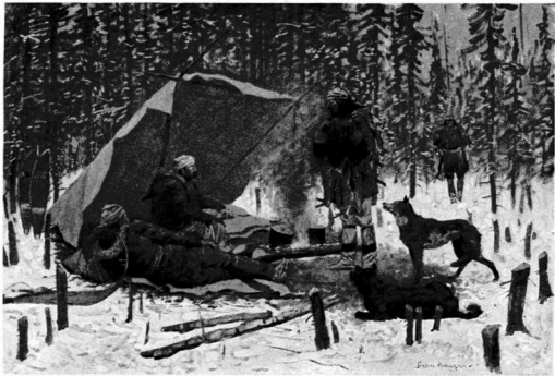
THE "RABBIT CAMP."