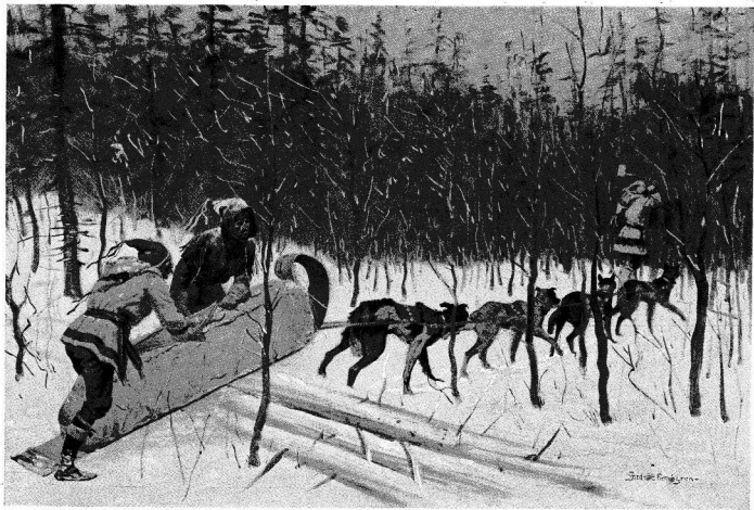
CUTTING A WAY THROUGH THE SMALL FIRS.