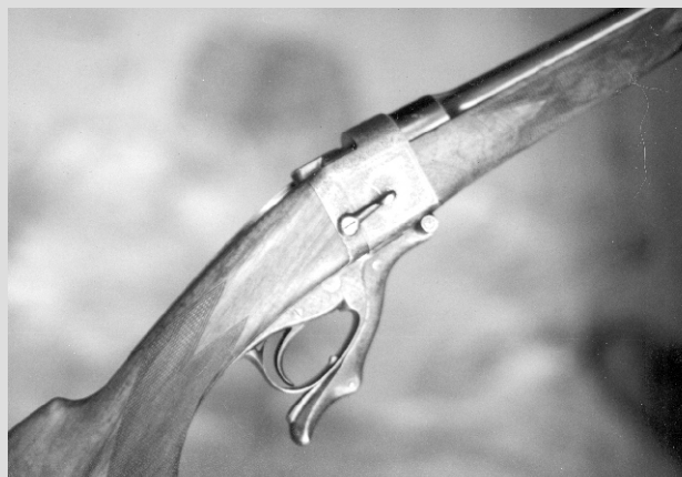
An exquisite Gibbs-Farqueson built on the medium sized action.

today very moderate speed (but high velocity in comparison to black powder) was the one which caught everyone's attention way back then.