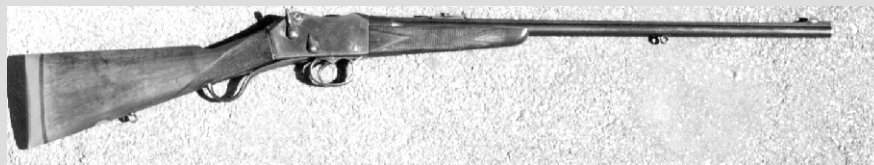
A Martini-Enfield .303 sporter. Note the added safety catch, selected stock, fitted recoil pad and improved sights compared to the military versions.

the breech invariably jammed, and the empty cases stuck, so that they had to be knocked out with a stick. Altogether, I found my prejudices against big guns in no way removed..." For those of you who may be wondering, a 10 bore fires a bullet of approximately .775", and even this did not hold a candle to the 8-bores (.835") and 4-bores (1.052"), which were also recommended elephant slayers of the period. Although black powder develops more of a push than a punch, such massive bullets behind huge amounts of powder develops a recoil which can be described as prodigious (among other things!). Your esteemed editor Don Heath and myself can attest to the effects of firing a 4-bore cartridge single shot rifle once belonging to Frederick Courtney Selous. Indeed, I recall a video sequence of Don firing this awesome rifle; the bullet sped one way and Don and the rifle sped the other way, leaving only a cumulonimbus of black powder smoke in the frame which an entire herd of elephants could have lurked behind!