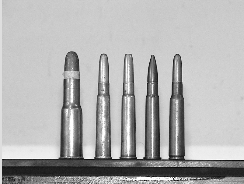
The .303 and its contemporaries. L-R: Martini-Henry .577 / 450, the black powder cartridge that the .303 replaced in military service: Mk II .303, note that the bullet has a cupro nickel jacket: Mk V hollow point, the original "Dum-dum": The Mk VII round with the lighter 174 grain spitzer bullet, note that the bullet's jacket is the copper coloured gilding metal: The 7x57 Mauser introduced in 1892, note the cupro nickel jacket on the bullet.

Much has been written and expressed concerning the use of various calibres in the hunting fields of Africa, and many have come to be regarded as African classics. None were quite so ubiquitous nor so frequently used as the .303. However, a bit of a conundrum presents itself concerning this grand old calibre in early Africa. Upon introduction it was a sensation, but notwithstanding this one has to search hard and long in the hunting literature of old for any mention of the .303. It seems as though, after a while, the .303 became so common and so widely used that it was largely taken for granted, and attention was diverted to more exotic, more powerful and altogether newer calibres.