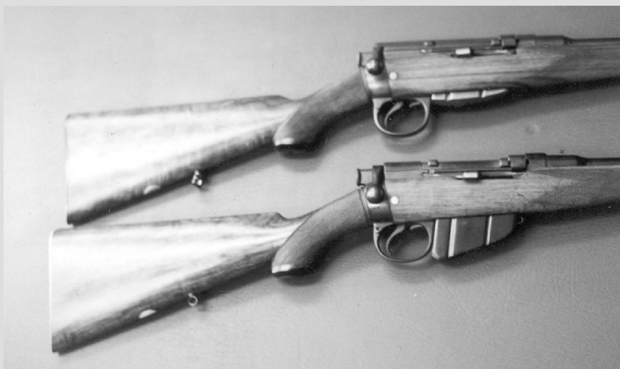
Two sporters built on early Lee-Enfield actions. Note the magazine cut-off fitted to both rifles so that they can be conveniently used as single shots.