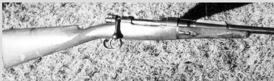
A take down .303 built on a mauser '98 action